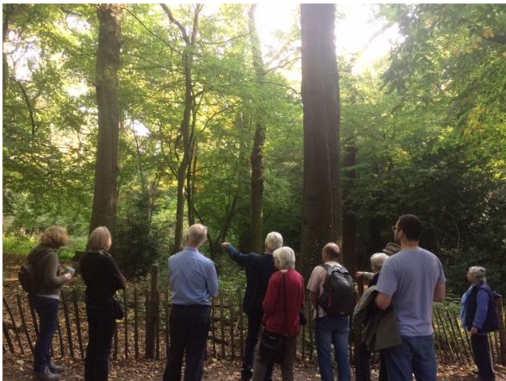
Figure 4: Queen's Wood and Highgate Wood Walk