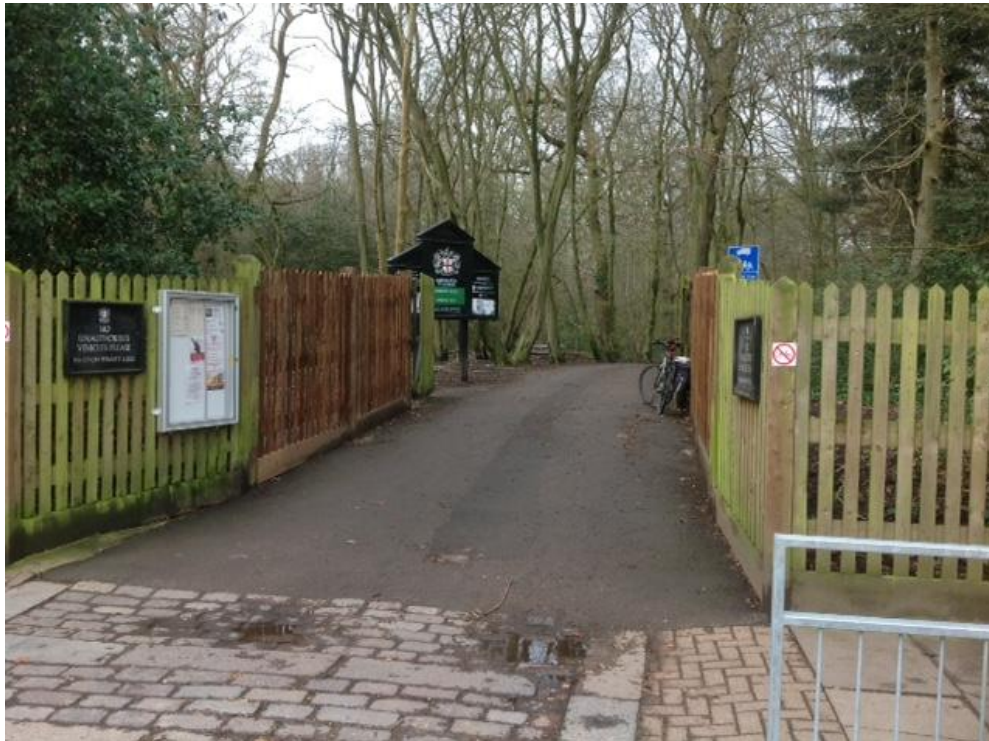
Figure 8: Onslow Gate will be have new electric gates