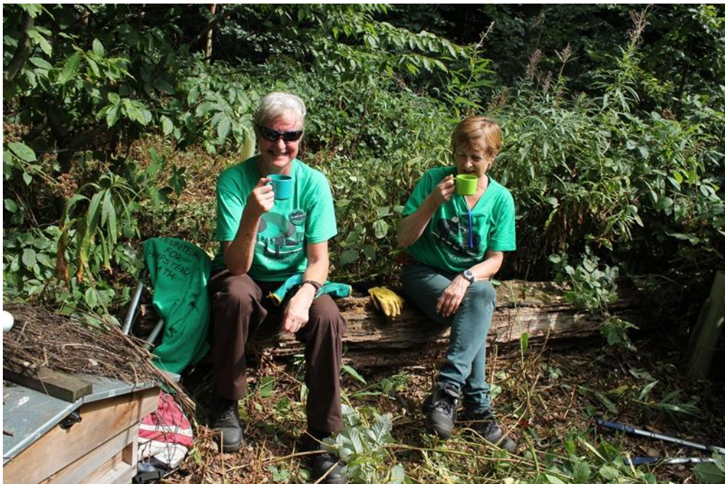
Figure 1: Volunteers enjoying a cup of tea