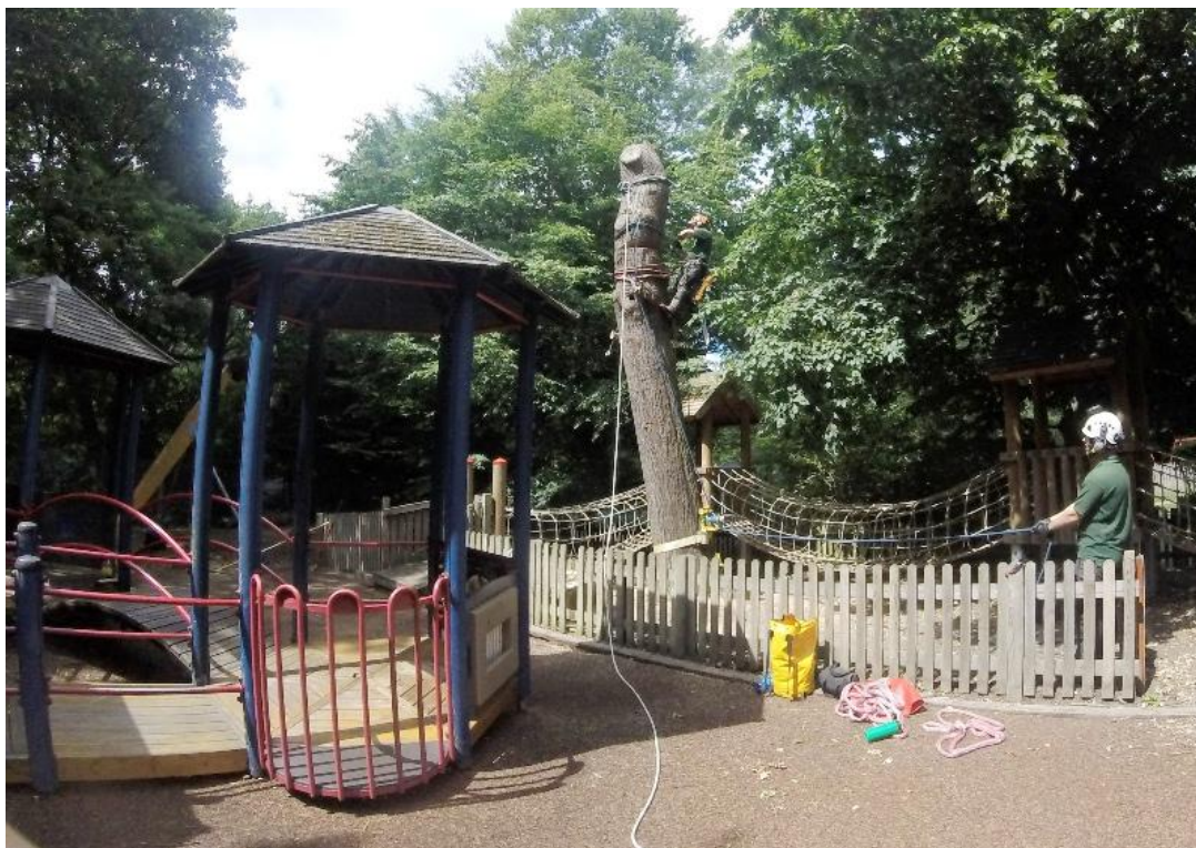
Figure 3: dismantling dead oak in play area