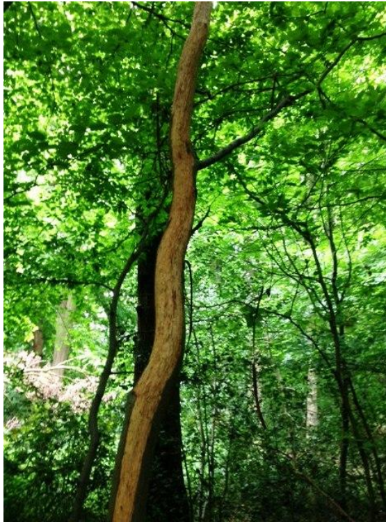
Figure 2: extreme bark damage on young hornbeam

trees. The explanation for the level of bark stripping is still not clearly understood, but it could have been connected with a very poor 'mast' year the previous autumn. This would have caused a significant deficit in food for the squirrels over the autumn and early spring. The same levels of damage have been recorded on other sites. A number of the younger trees are so badly stripped that they will probably have to be felled.