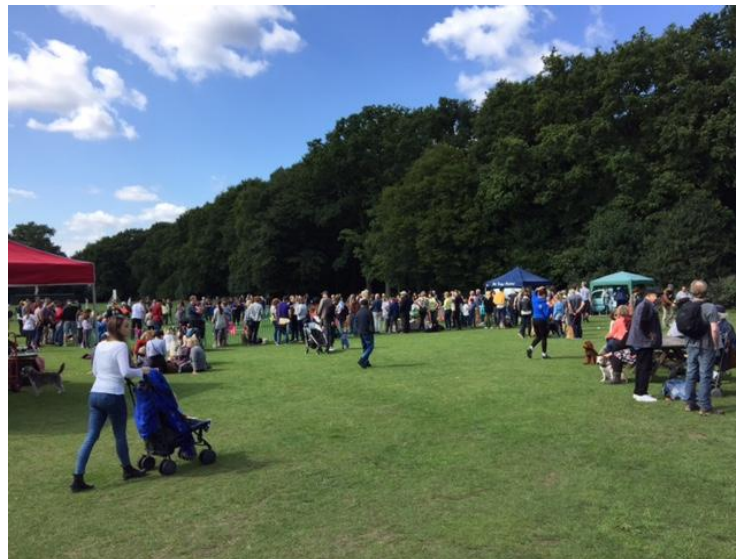
Figure 7: Community Day Event with Dog Show in progress.